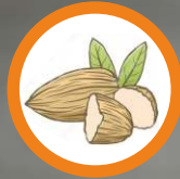
Nuts & Spices